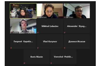
NAIST consultation booth