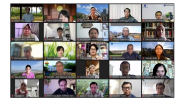
NAIST Indonesia Office 6th Anniversary Symposium participants