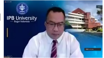
Greeting speech by IPB President

The Symposium was followed by an Indonesian NAIST Alumni Association (INAA) Reunion and alumni of our 8 partner universities made presentations of their current research activities. Both events ended as a great success with more than 250 participants in total.