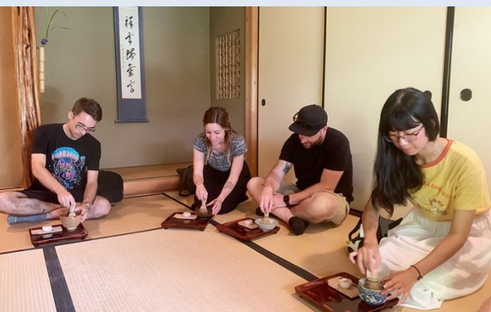
▲ Matcha experience at tea whisk workshop