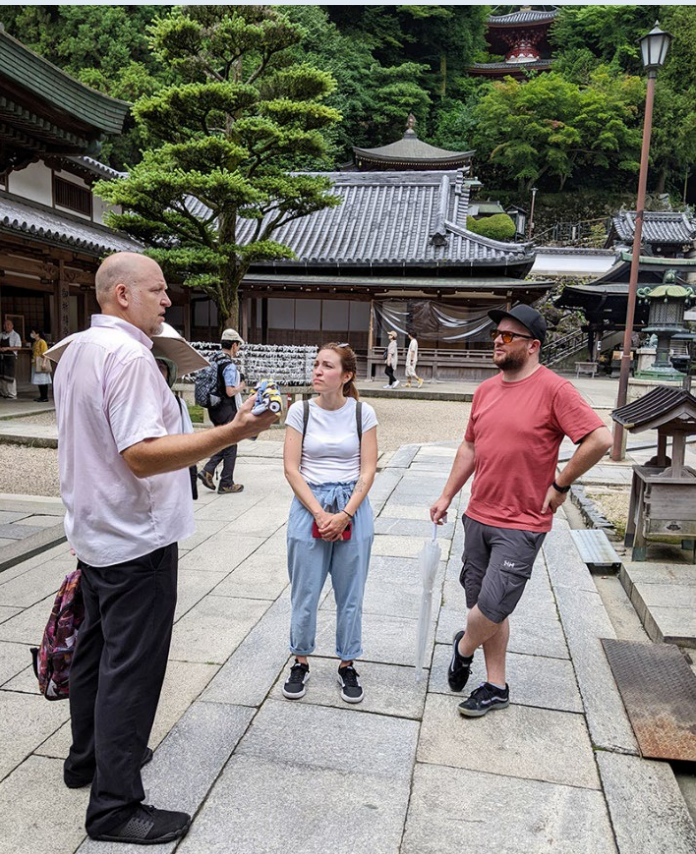
▲ Visit to Hozanji Temple