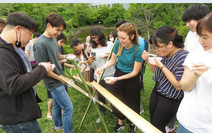
▲ Nagashi-somen with students